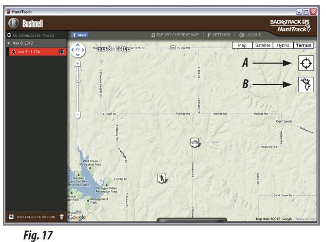
Click '+' to add a custom location