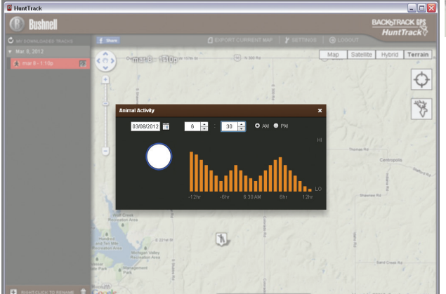
Fig. 20 Download from Www.Somanuals.com. All Manuals Search And Download.