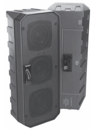
PI30-SP Non-Powered Speaker