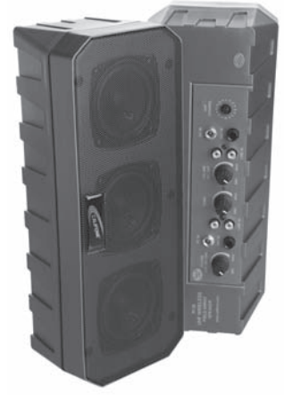
PI30 16-Channel UHF Powered Speaker