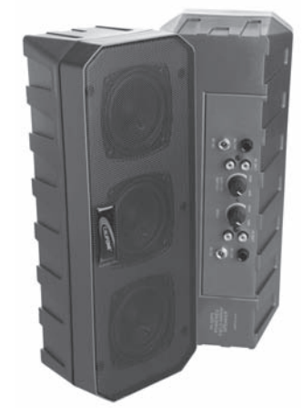
PI30-PS Powered Speaker