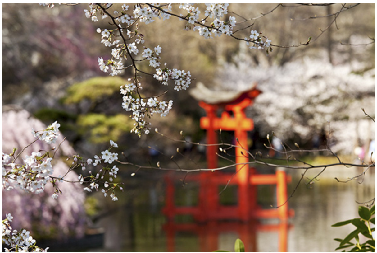
Figure 2 - Japanese Garden, Brooklyn, NY - Autofocus, exposure metering mode, aperture, shutter speed, ISO, and white balance all considered in creating this image. Shutter speed 1/125, aperture f/6.3, ISO 200

Since the camera is a tool to take the images you want to take, you can't always allow the camera to make decisions for you. You have to take control of the camera to ensure that you capture exactly the images you intend - by autofocusing where you want, setting the aperture or shutter speed that you want, and obtaining the exposure you want. While the T3i is an intelligent camera, it cannot read your mind and your intentions and does not know that you wish to focus on and properly expose the small blossoms in the foreground, while making the background appear out of focus, and the branches to be caught still and not be blurred from the motion of the wind, on this bright, sunny day (see Figure 2 ). You have to tell the camera to do all of this, through the various controls and settings, such as the autofocus AF Mode (focus on the blossoms), the Exposure Metering Mode (properly expose the blossoms), the Aperture setting (the out-of-focus background), the Shutter Speed (freezing the motion of the branches), the ISO (bright day) and the White Balance (sunny day).