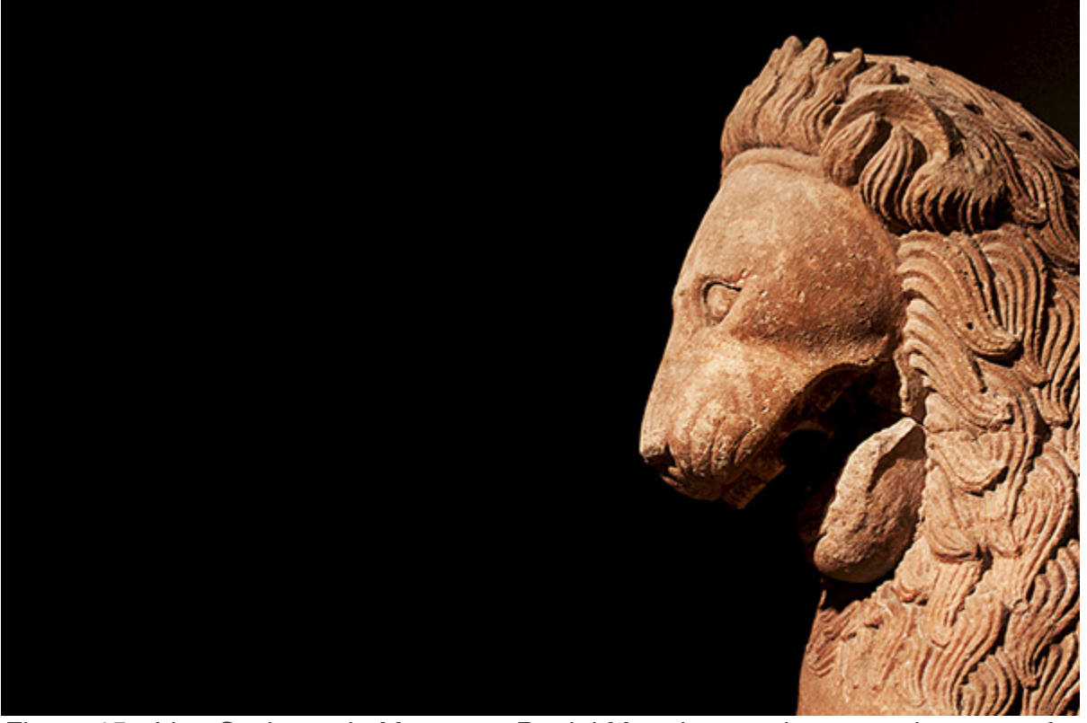
Figure 15 - Lion Sculpture in Museum - Partial Metering used to properly expose for the subject, then focus and exposure locked, and framing recomposed to place subject off center. (Very carefully hand-held at very slow shutter speed.) Shutter speed 1/13, aperture f/4.0, ISO 800

want the face or the subject to be properly exposed and not risk blowing the shot, it is worth it to use Partial Metering mode. Another time to use this is when there is a wide range of light in your scene, from bright sunlight to deep shadows. You will need to determine and lock the exposure settings of a critical area of the scene - a face or a middle tone in the area you want properly exposed (see Figure 15 ). Remember, this mode is not linked to your focus point. The partial area that is metered is always in the center, so meter on a face or middle tone in the part of the scene that is most critical and that you want properly exposed, using the central area of the viewfinder. Lock in that exposure using Exposure Lock (explained below), then focus, recompose and take the shot.