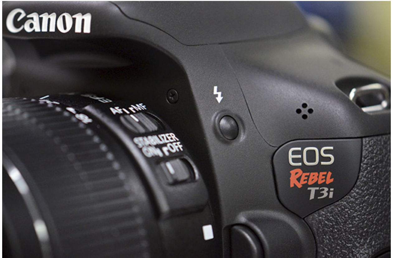
Figure 1 - Detail of the Canon T3i

It is up to you to make use of its features and capabilities to create the images you envision. While the camera's manual can tell you about the settings and controls and how they function, this guide will build upon that and tell you when and why you want to use them. Every button, menu item, and Custom Function setting of the T3i is there for a reason: to help you capture the images you want. Some of them are more useful to different types of photographers and shooting situations and you don't need to learn and use them all immediately, but this guide should help to give you the knowledge to confidently use the ones that turn your Canon Rebel T3i into an image capturing tool that works best for you.