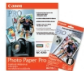
PR-101 Photo Paper Pro and PR-101 6" x 4" photo cards.

CV-100 1.5" Colour TFT LCD display for viewing images before printing