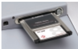
Accepts a wide range of PC card compatible media. 4

Combining a 6-colour high/low density ink system with Advanced MicroFine Droplet Technology, the S830D delivers resolution up to 2400 dpi, with accurate, vibrant colour. And speed is not sacrificed for quality. The S830D will produce high-resolution A4 photos in as little as two minutes, while a postcard sized photo takes around one. 3