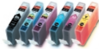
From left: BCI-6BK, BCI-6PC, BCI-6PM, BCI-6C, BCI-6M, BCI-6Y