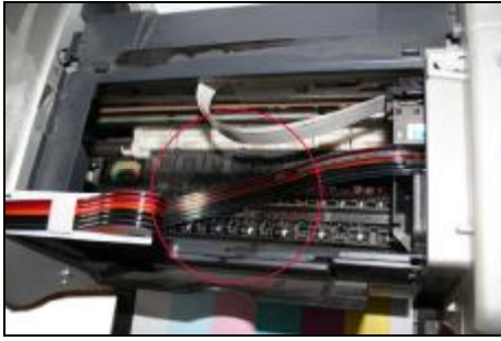
Too long is no good.