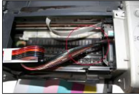
Twisted line is no good.