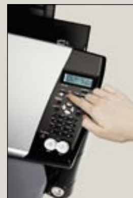
The user-friendly control panel allows access to photo printing, faxing and copying without the need for a computer