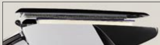
Advanced Z-lid allows bulky items to be scanned and copied