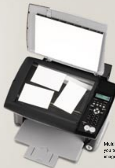
Multi-Photo mode allows you to scan multiple images at one time 3