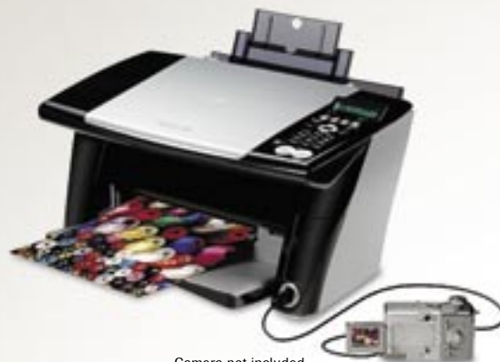
Camera not included