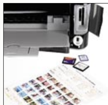
Print directly from your camera's memory card. Use the Photo Index Sheet for image preview and selection