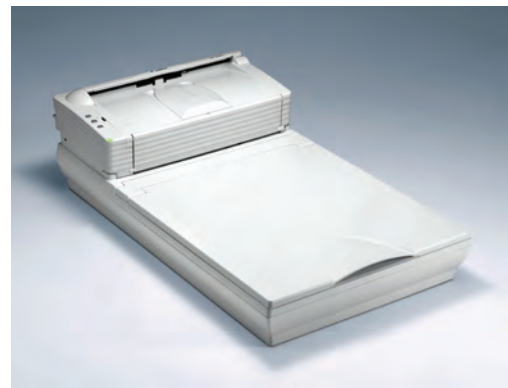
DR-2580C Scanner with Optional Flatbed Scanner

Compact, powerful, and fast. The Canon imageFORMULA DR-2580C color scanner is designed to meet the diverse imaging needs of any busy office. This innovative scanner offers the most advanced features in document scanning. Boasting record speeds for scanning and saving to searchable PDF has earned the DR-2580C scanner PC Magazine's Editors' Choice award and the Buyers Laboratory Inc. "Recommended" award. Not surprising since it's from Canon, the brand the world relies on for the latest solutions in imaging technology.