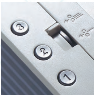
Scan-To-Job Buttons for One-Touch Operation

The DR-2580C scanner is not only one of the smallest and most versatile in its class, but it's also incredibly easy to use.