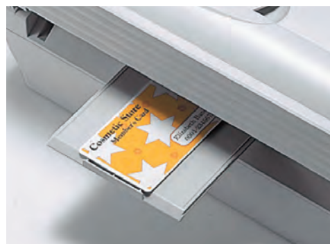
Straight Path for Card Scanning

The DR-2580C scanner also includes the Rapid Recovery System, which sends only completed image data to the application software, offering seamless scanning operation should a feeding error occur. And the Punch Hole Removal function removes the black dots that appear when scanning pages from booklets or binders.