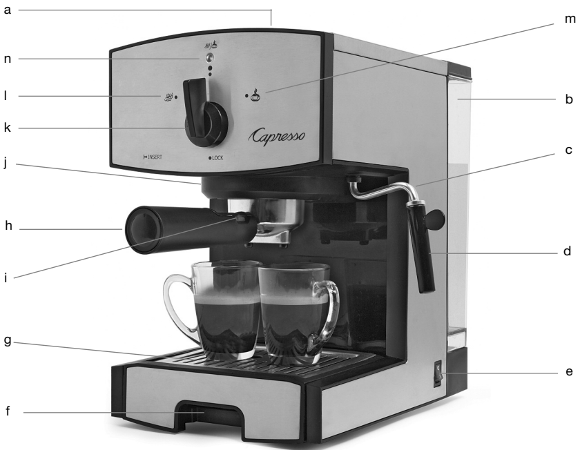
Fig. 1 Capresso EC50 User Components