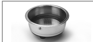
Dual function sieve (for 1 or 2 cups)