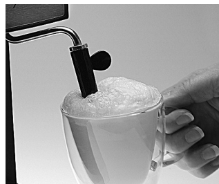
Steam Wand (remove Black Frothing Sleeve) for steaming only