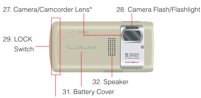
30. Internal Antenna Area***