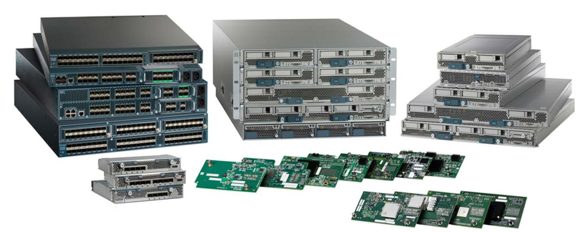
Figure 2. Cisco UCS 6200 Series Fabric Interconnects

From a networking perspective, the Cisco UCS 6200 Series uses a cut-through architecture, supporting deterministic, low-latency, line-rate 10 Gigabit Ethernet on all ports, switching capacity of 2 terabits (Tb), and 320-Gbps bandwidth per chassis, independent of packet size and enabled services. The product family supports Cisco<sup>®</sup> low-latency, lossless 10 Gigabit Ethernet<sup>1</sup> unified network fabric capabilities, which increase the reliability, efficiency, and scalability of Ethernet networks. The fabric interconnect supports multiple traffic classes over a lossless Ethernet fabric from the blade through the interconnect. Significant TCO savings come from an FCoE-optimized server design in which network interface cards (NICs), host bus adapters (HBAs), cables, and switches can be consolidated.