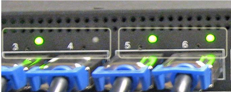
Figure 1–3 Switch LEDs

Note: Ports 3 and 4 illustrate a x8 connection with a single LED lit while Ports 5 and 6 illustrate two independent x4 connections with a LED lit for each port.