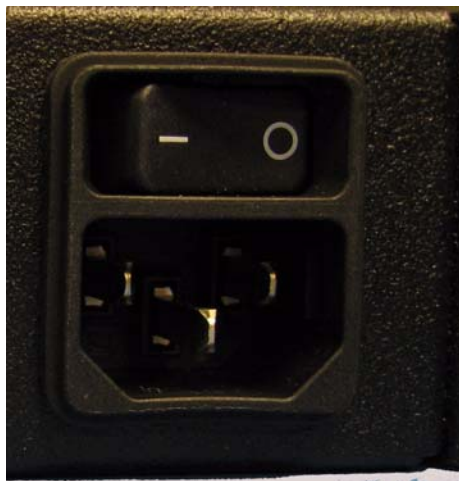
Figure 1–1 AC Power Inlet