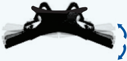
Angle – Forward/Backward