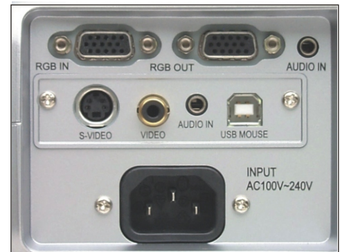
The ImagePro 8756A inputs are easily accessible.

At 7.2 lbs it's easy to transport with the included soft carry case. This value packed projector has a XGA resolution with advanced electronics that permit showing SXGA or VGA images. An IR remote control permits operation from convenient locations and can turn the projector completely "On" or "Off".