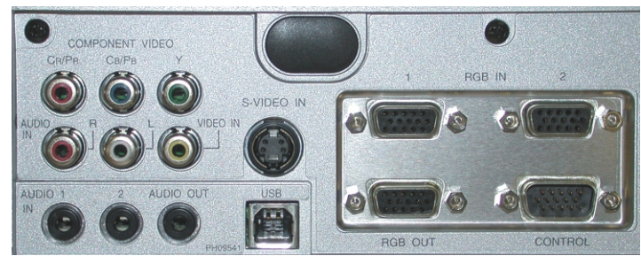
The ImagePro 8801A inputs are easily accessible.

quieter operation with whisper mode setting, plus a 400-1 contrast, and a Kensington slot for secure installation. A custom start-up screen and digital horizontal & vertical keystone correction complete the features.