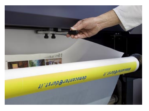
The integrated manual cutting device secures operation-friendly cross cutting