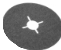
Unit = 100 Discs