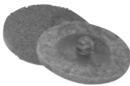
4" Disc Unit = 100 Discs