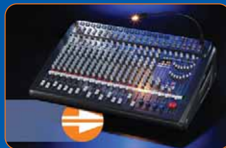
12 MIC/LINE+ 4 MIC/STEREO LINE PowerMate 1600-2 230 V #112960