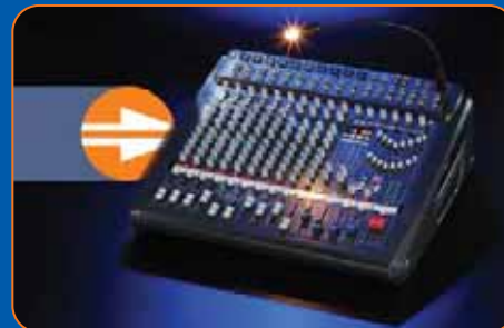
6 MIC/LINE+ 4 MIC/STEREO LINE PowerMate 1000-2 230 V #112926

* Mixing desk in rated condition, Unity Gain (MIC Gain 20 dB), all faders position 0 dB, all pots in mid position, Master fader + 6dB, amplifier rated output power into 8 ohms, Dual channel, unless otherwise specified.