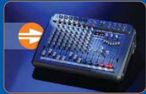
6 MIC/LINE + 2 STEREO LINE PowerMate600-2 230V #112959

* Mixing desk in rated condition, Unity Gain (MIC Gain 20 dB), all faders position 0 dB, all pots in mid position, Master fader + 6dB, amplifier rated output power into 8 ohms, Dual channel, unless otherwise specified.