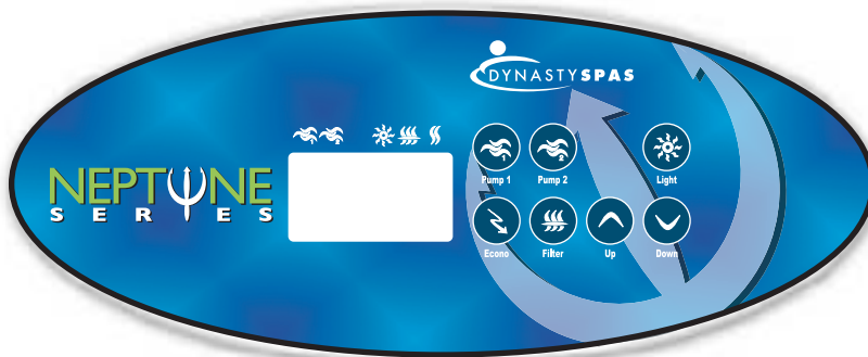
The Quick Reference Card provides a quick overview of your spa's main functions and the operations accessible with your digital control pad.