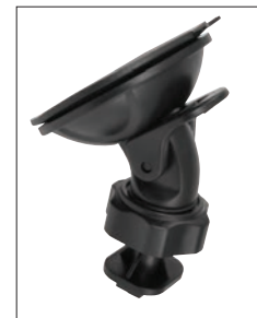
Suction Cup Bracket

The CDR 810 should be mounted to the windshield using the included Suction Cup Mount. Make sure to line the unit up so that it has a clear view of the road. If you are rotating the camera to view the cab, make sure to change the Rotate Setting to ON in the Tools Menu.