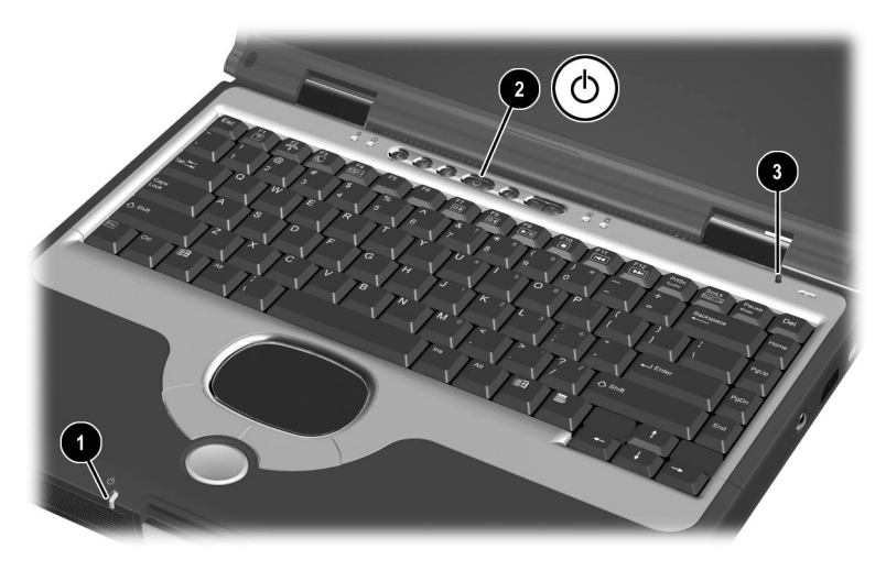
Identifying the power/standby light, power button, and display switch

The procedures for using Standby, Hibernation, and Shutdown use the power/Standby light \mathbf{0} , the power button \mathbf{0} , and the display switch \mathbf{0} .