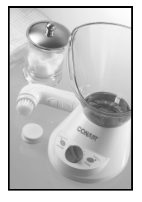
Instruction Booklet Model MDF2