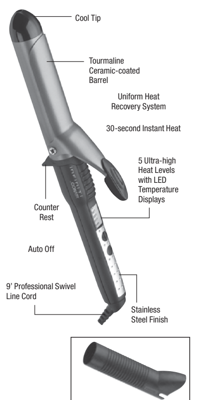
Protective heat shield for safe, easy storage