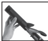
Protective Heat Shield