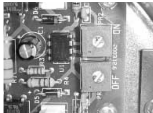
FIGURE 3. Timer Board Settings Reset