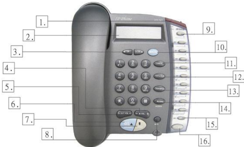
Figure 3. Keypad illustration