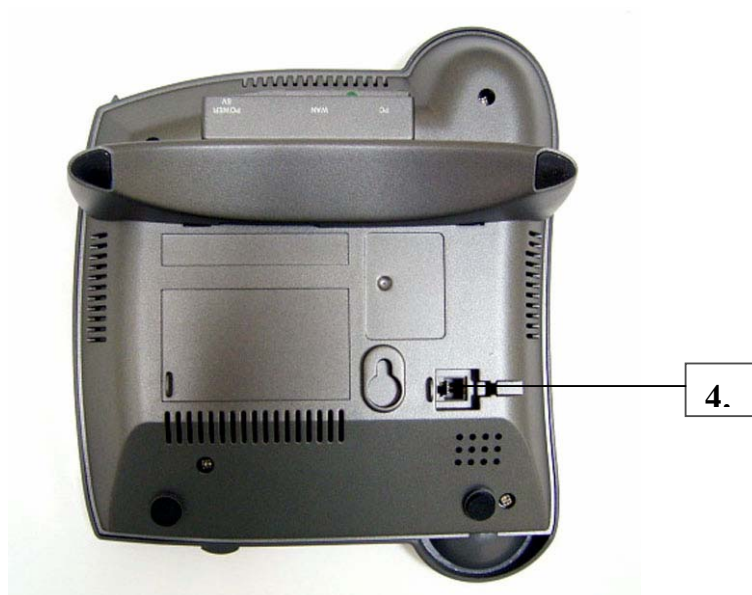
Figure 3. Back Side Panel of the IP Phone