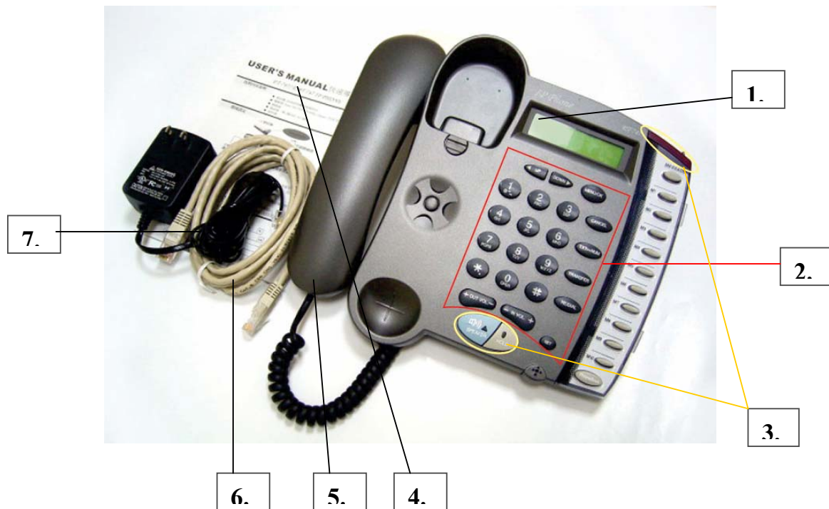
Figure 1. Key parts of the VOIP 2747 series IP Phone