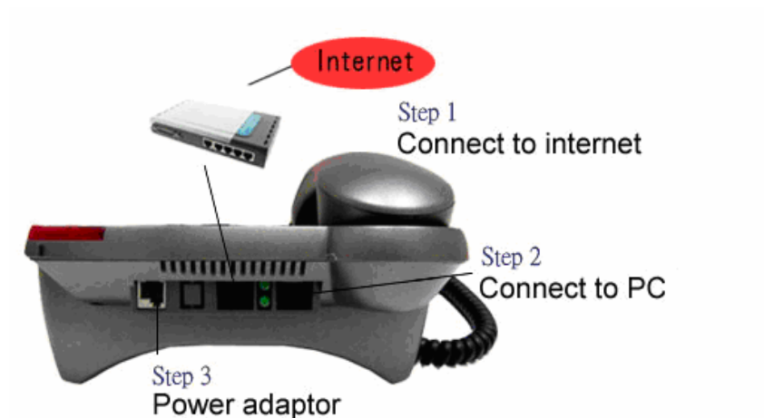
Figure 4. Installation Environment