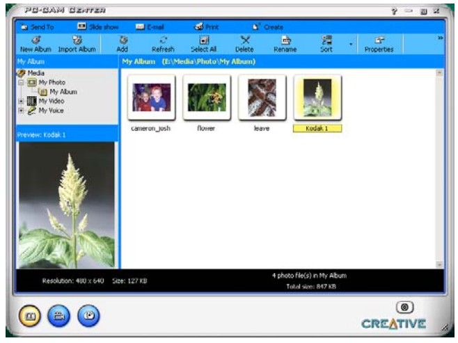
Figure 2-1: PC-CAM Center screen.

Plug your camera into the USB port and let Windows