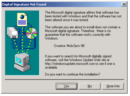
Figure 1-3: Digital Signature Not Found dialog box.