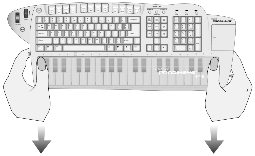
Figure 1-2: Removing the music keyboard cover.

To remove the music keyboard cover: Press down the upper corners of the cover and slide it out, as shown below.