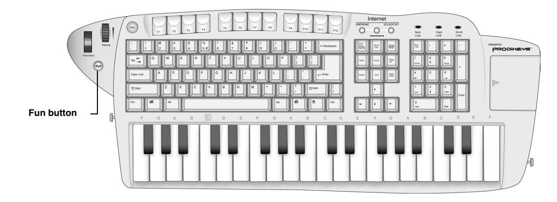
Figure 3-1: Creative Prodikeys keyboard.

You will need to start Creative Prodikeys before you can play on the Creative Prodikeys music keyboard. To start the software: Press the Fun button on the Creative Prodikeys keyboard.