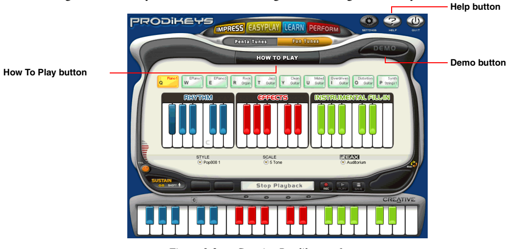
Figure 3-2: Creative Prodikeys software.

After starting the software, you should see something similar to Figure 3-2 on your screen.