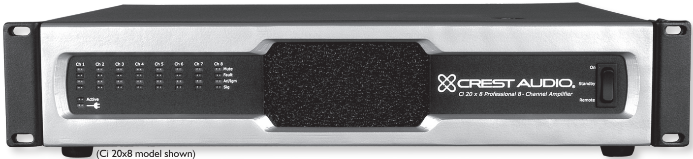
(Ci 20x8 model shown)