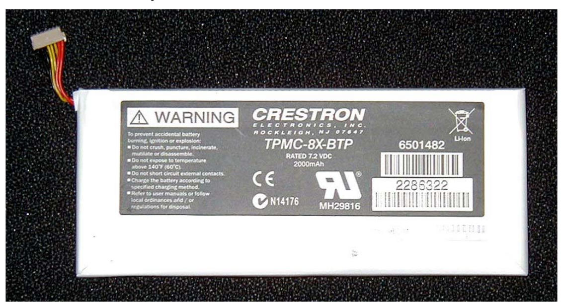
TPMC-8X-BTP Physical View

The TPMC-8X-BTP has a multi-pin connector for attachment inside the battery compartment of the TPMC-8X.