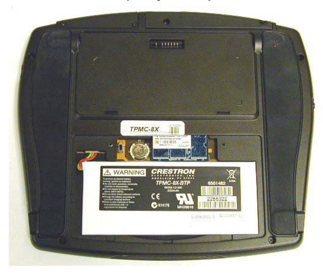
TPMC-8X-BTP in Battery Compartment of TPMC-8X

NOTE: To prevent battery drain during shipment or for long-term storage, the TPMC-8X has a battery switch inside the battery compartment. To use the internal battery, move the switch to the up (on) position. To conserve battery power when the unit will not be used for extended periods, move the switch to the down (off) position. (Refer to illustration on the following page.)