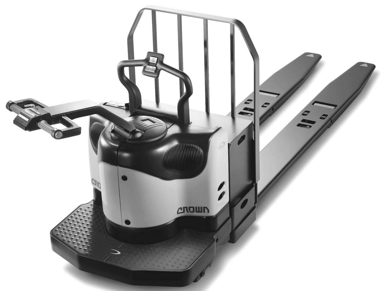
Download from Www.Somanuals.com. All Manuals Search And Download.