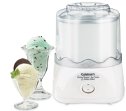
Ice Cream Makers

Discover the complete line of Cuisinart® brand premier kitchen appliances including food processors, mini food processors, hand mixers, blenders, toasters, coffeemakers, cookware, ice cream makers and toaster ovens at