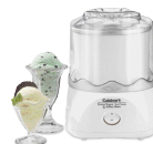
Ice Cream Makers

Cuisinart offers an extensive assortment of top quality products to make life in the kitchen easier than ever. Try some of our other countertop appliances and cookware, and Savor the Good Life™.