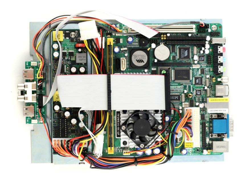
Figure 1.0, bottom mounting plate