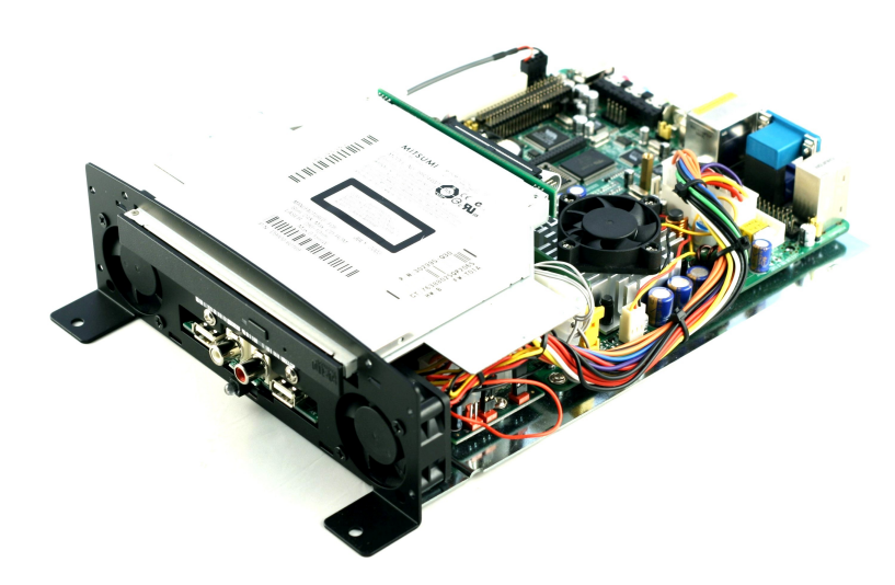
Figure 1.1, bottom mounting plate