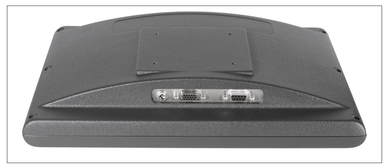
Power, VGA, & Touchscreen connectors on bottom of unit.

In addition to the above, the touchscreen model has an extra cable terminating in a 9-pin serial connector which connects to one of the PC's serial ports.