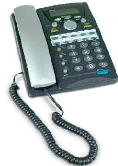
DPH-140S Business IP Phone

Other D-Link products that work with the DPH-140S: