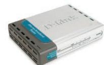
DI-604 Broadband Ethernet Router