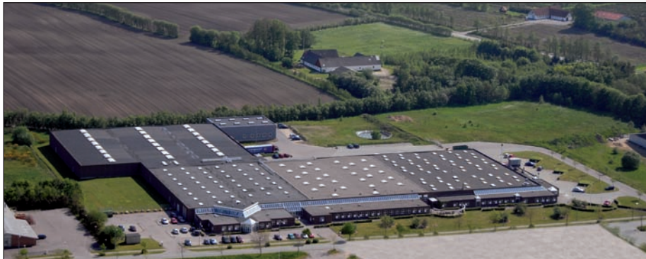
DALI headquarters, Denmark

With a reputation for quality, reliability and integrity, DALI offers an exciting range to suit every taste from the ultimate performance speakers to the cost-conscious series.