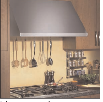
Millennia® 36" x 18" (different views)