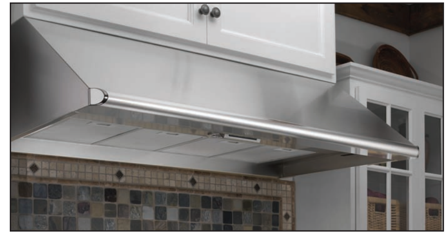
Epicure<sup>®</sup> 48" x I2" with New Anodized Filter Construction