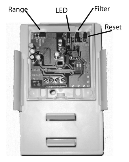
Figure 1 PIR with cover removed

1. When looking at the PIR you will see clips on the sides of the plastic case. Push one of the clips away from the center of the case and lift out the PIR and the plastic backing. You will now be looking inside of the case at the radio transmitter (figure 2)