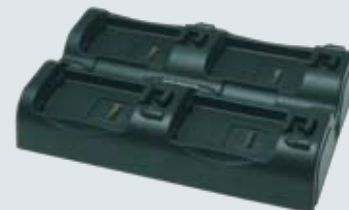
Multiple Battery Charger