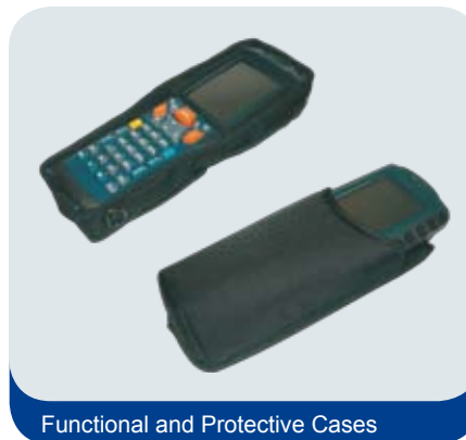
Functional and Protective Cases