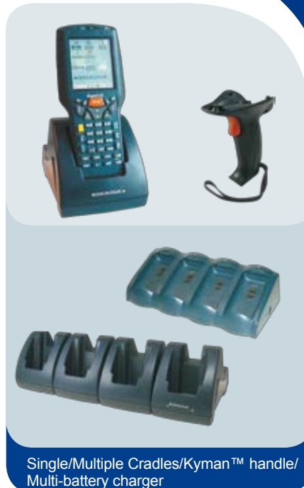
Single/Multiple Cradles/Kyman™ handle/ Multi-battery charger