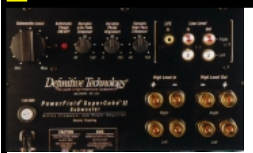
These listings are based on the manufacturer's stated specs; the HT Labs box below indicates the gear's performance on