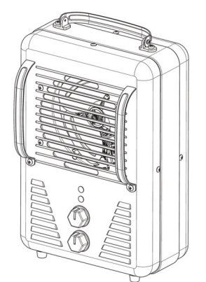
Model/Modele/Modello DUH 400

Register this product on-line and receive a free trial issue of Cook's Illustrated. Visit www.delonghiregistration.com. Visit www.delonghi.com for a list of service centers near you. (U.S. Only).