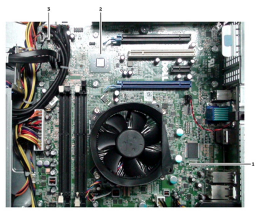
Figure 2. System Board with the thermal sensor and heatsink removed

The power supply thermal sensor is removed from the desktop chassis only.