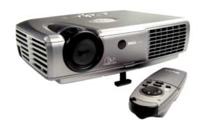
Dell 3200MP Projector

Visit www.euro.dell.com for more information.