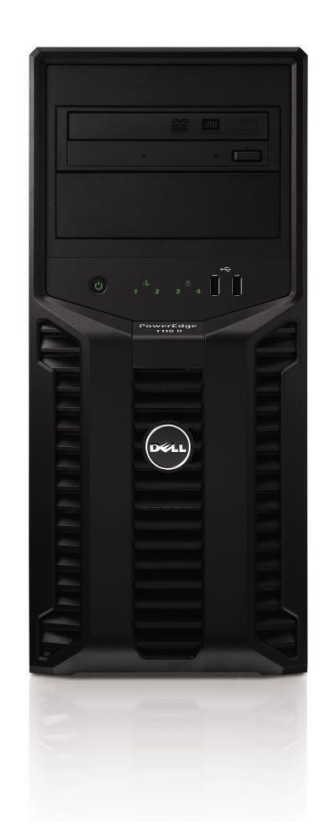
Figure 2. Front-Panel View

Figure 2 shows the front-panel view of the PowerEdge T110 II.