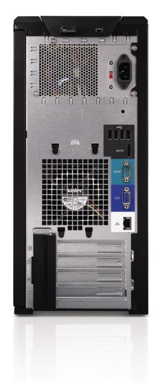
Figure 3. Back-Panel View

Figure 3 shows the back-panel view of the PowerEdge T110 II.