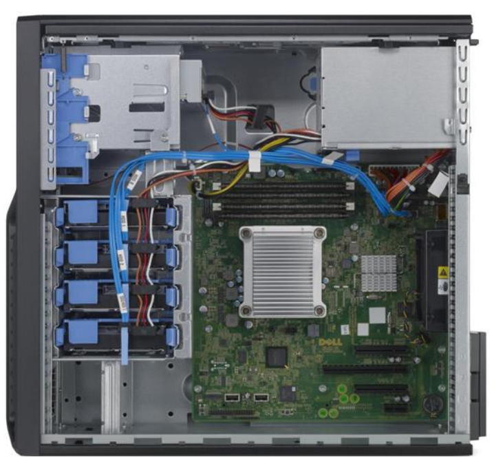
Figure 4. Internal-Chassis View

Figure 4 shows the internal-chassis view of the PowerEdge T110 II.