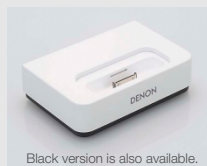
Black version is also available.

for more details on compliant models and connection procedures.