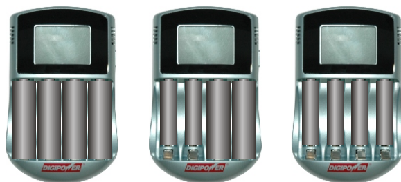
Fig.1 Charging 4pcs of AA or AAA