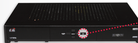
Receiver image may vary.