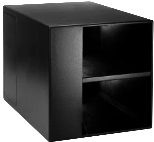
Portable version shown