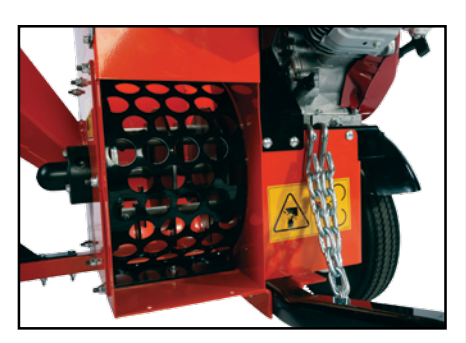
These chipper/shredders have easy access to the discharge door, making debris simple to move.

These chipper/shredders come with 1.5" standard screen, 3 additional screens available.