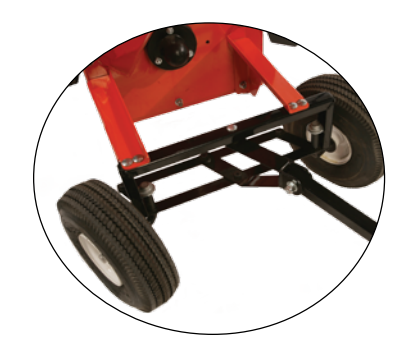
The new "Four-Wheel Tow Hitch", 75591-00, allows for easy hookup and towing capabilities.